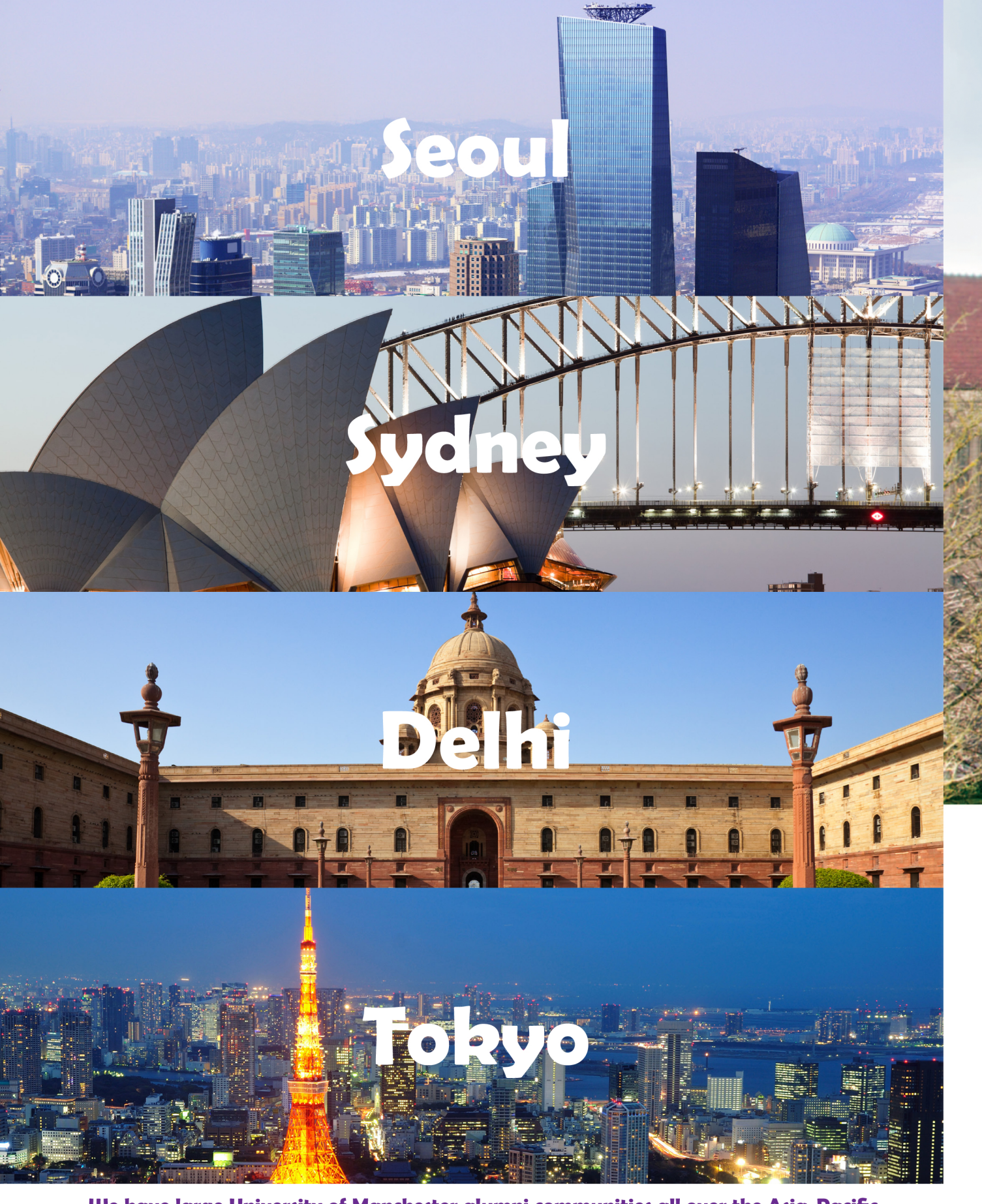
We have large University of Manchester alumni communities all over the Asia-Pacific region, including in Seoul , Sydney , Delhi , and Tokyo. If you'd like to make contact with your local branch of the Alumni Association, email us alumni@manchester. ac.uk.